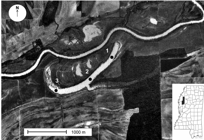
Figure 1. Aerial photograph showing three sampling locations for sediment quality assessment of Beasley Lake, Sunflower County, MS, USA: latitude 33°24'15" N, longitude 90° 40'05" W.

is ~915 ha and the lake has a surface area of ~25–30 ha. An unusual feature of the watershed is a 5.5-m change in elevation from the highest point in the watershed to the lake, whereas most Delta oxbow lake watersheds have a <3 m change [16]. Approximately 150 ha of the watershed is non-arable wetland with hardwood forest and herbaceous riparian vegetation. The 722 ha of arable land in the watershed has been primarily farmed in cotton ( Gossypium hirsutum L.), corn ( Zea mays L.), and soybeans ( Glycine max [L.] Merr.) and occasionally milo ( Sorghum bicolor L.). Cropping patterns within the watershed have varied over the 14-year observation period (Figure 2). From 1995 to 2001, an average 508 ha cotton, 117 ha soybeans and 62 ha corn were planted. Agricultural land use from 2002 to 2008 in the watershed included 70 ha cotton, 376 ha soybean and 33 ha corn. Beginning in 1995, only structural BMPs (e.g. grassed buffers, slotted pipes) were in-place in the watershed. These BMPs were followed with the implementation of reduced tillage in specific regions of the watershed in 2001, reduced tillage throughout the entire watershed in 2003, and most recently, CRP enrolment in 2003 consisting of 91 ha planted with hardwood cottonwood ( Populus deltoides Bartr. ex. Marsh.) trees [15].